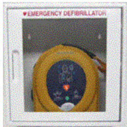
Wall Cabinet with Alarm

* Medical Prescription needed if not a Fire, EMS or Police Department and do not have clinician oversight of an AED program.