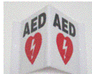
3D Wall Sign

Adult PadPak $110 Pediatric PadPak $140 Wall Cabinet with Alarm $175 Wall Bracket $95 3D Wall Sign $25 AMBU AED Rescue Kit $30 Medical Prescription $30 * AED Trainer System $400 Saver Software & Cable $300