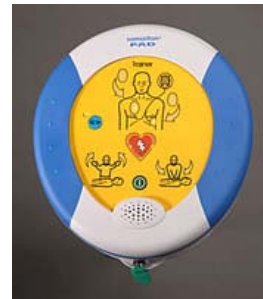
Trainer with 8 pre-recorded training scenarios