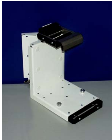
Wall Mount with swivel is Right-hinged (swivels to right)

Mounts to Wall Swivel and locks at 0°, 10°, 20°, 30° or 40° angles