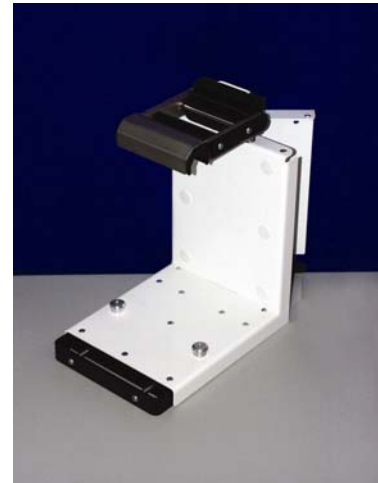
During installation, you can convert Right-hinged Wall Mount into a Left-hinged Mount)

Mounting feet (12oz) attach to & secure bottom of LIFEPAK. Works with standard Physio carry cases.